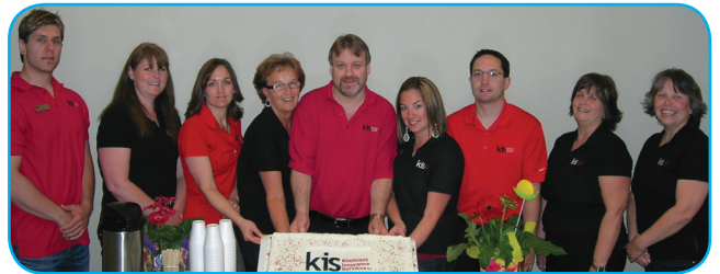
Kootenay Insurance Services in Cranbrook held a Customer Appreciation Day to thank their customers for their patience during recent renovations.