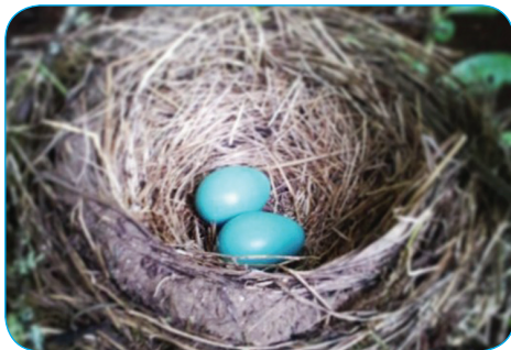
Christine Etele, SeaFirst Ins, Brentwood Bay: "Beautiful robin's nest."