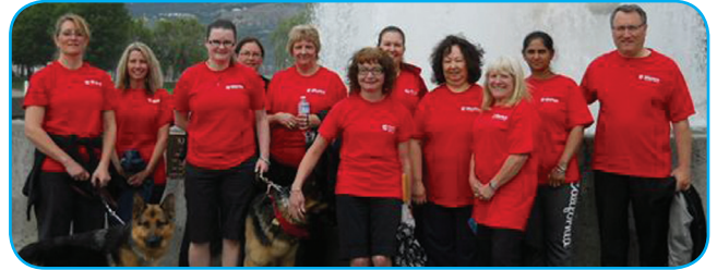
Western Financial Group's Harvey Branch (Kelowna) staff taking part in their annual Support the Cause Walk, projected to raise more than $133,000 for a variety of local charities.