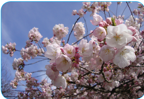
Cheryl Xue, Metrotown Dason Ins: "Vancouver cherry blos- soms."